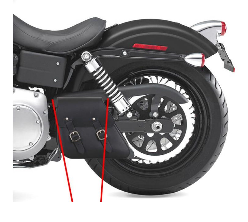
Fig.2 Once the metal holder has been fitted to the swing arm, position the bag on the on the bracket (e.g. with double-sided adhesive tape). Sit on the motorbike and check the clearance by compressing the shock absorbers.

Before you drill the necessary holes in the back of the saddlebag, it is very important to leave enough space between the shock absorber and the primary drive so that the shock absorbers/swingarms can compress.