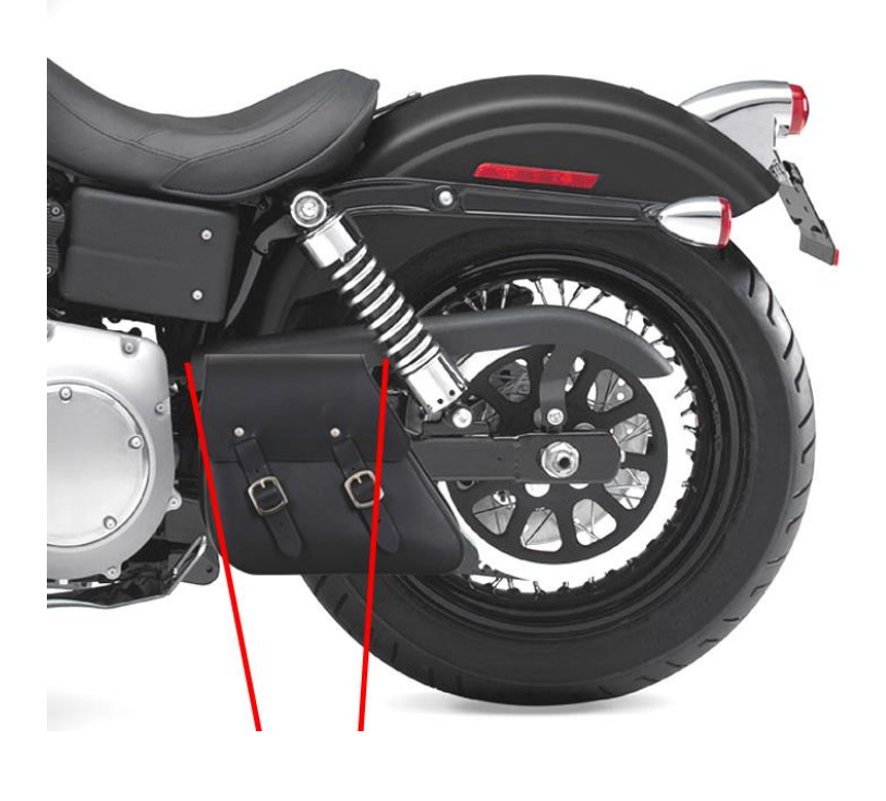
Once the metal holder has been fitted to the swing arm, position the bag on the on the bracket (e.g. with double-sided adhesive tape). Sit on the motorbike and check the clearance by compressing the shock absorbers.

Dorfstr. 9 24247 Mielkendorf Tel.: 0049-4347-706970 Fax.: 0049-4347-3201 info@hansen-styling-parts.de www.hansen-styling-parts.de www.buffalo-bag.com